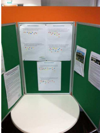
Picture from the 3VA Event

Here are the detailed minutes and papers from all of the Review meetings.